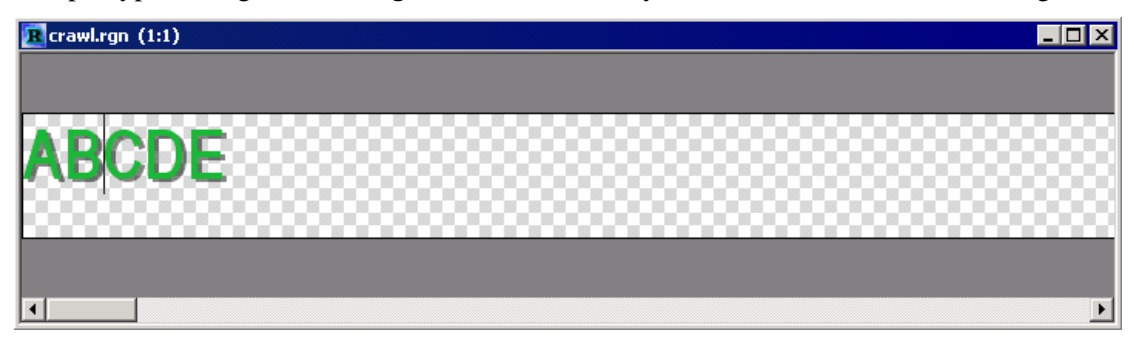
Figure 4. Text example in region crawl.rgn with style from crawl.efc

Text example typed in region crawl.rgn with use of first style from collection crawl.efc (Figure 4).