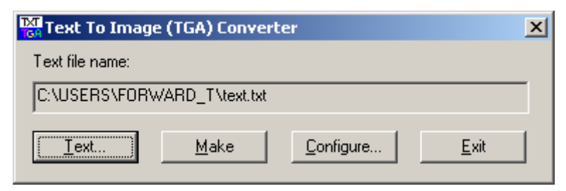
Figure 1. The TXT2TGA main window

TXT2TGA program is included in the complete software, which accompanies the Forward T products. This application is opened from menu Start/Programs/ForwardT Software/FD300 App/Tools/TXT2TGA . The Main Window for TXT2TGA is shown in Figure 1.