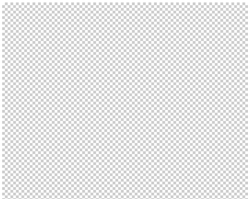
Figure 2. Additional window of application

The prepared script is displayed in the additional window of this application (Figure 2).